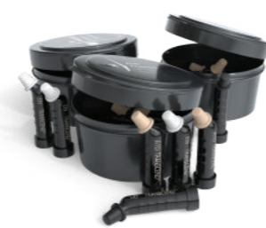
Transcend Singles 1pk 10 x 0,2 g singles