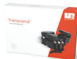
4814 - Transcend Singles Intro Kit 10 x 0,2 g singles of each shade: A1D, A2D, A3D, B1D, EN, EW, UB