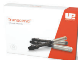
4726 - Transcend Syringe Intro Kit 1 x 4 g syringe of each shade: A1D, A2D, A3D, B1D, EN, EW, UB