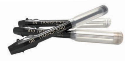
Transcend Syringe 1pk 4 g syringe