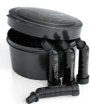
4757 - Transcend UB Singles 1pk 10 x 0,2 g singles Universal Body shade