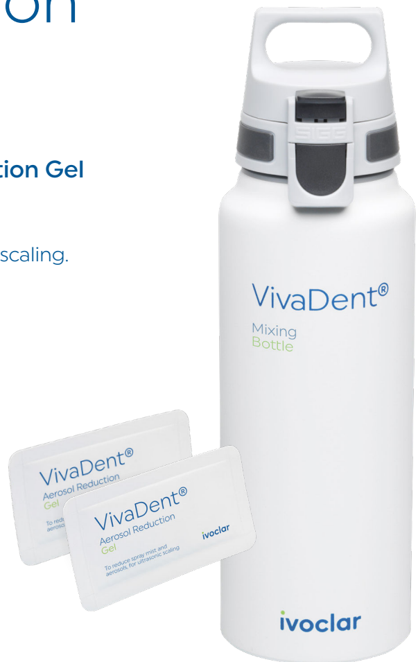
Ultrasonic scaler with Aerosol Reduction Gel

1x VivaDent Aerosol Reduction Gel Starter Kit